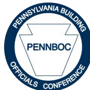
Exhibit your products, sponsor conference events, advertise in the conference program, or donate door prizes.

Exhibiting your products and services in a non-confrontational environment benefits your company, your customers, and the code officials you will meet on the job site. Attend sessions that will build your knowledge of codes, their application and enforcement.